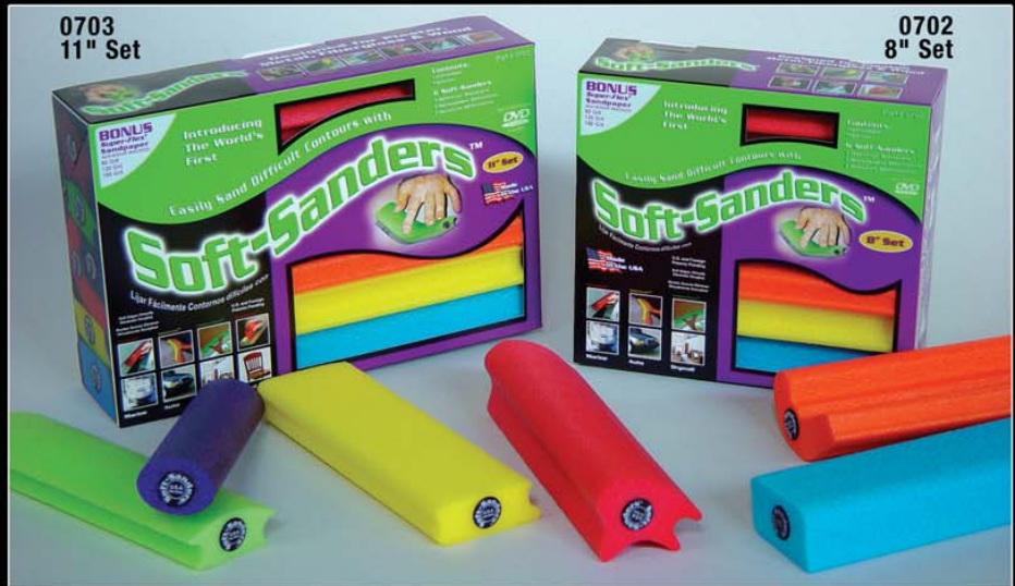
0703 11" Set