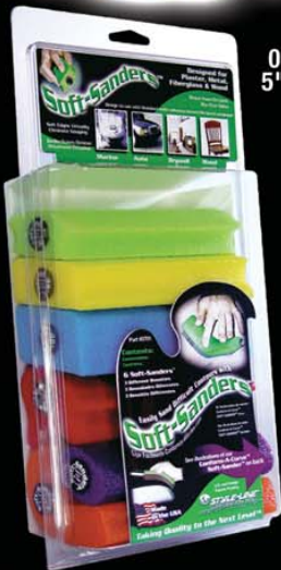
0701 5" Set

Tips & Techniques DVD VIDEO Included With Each Set